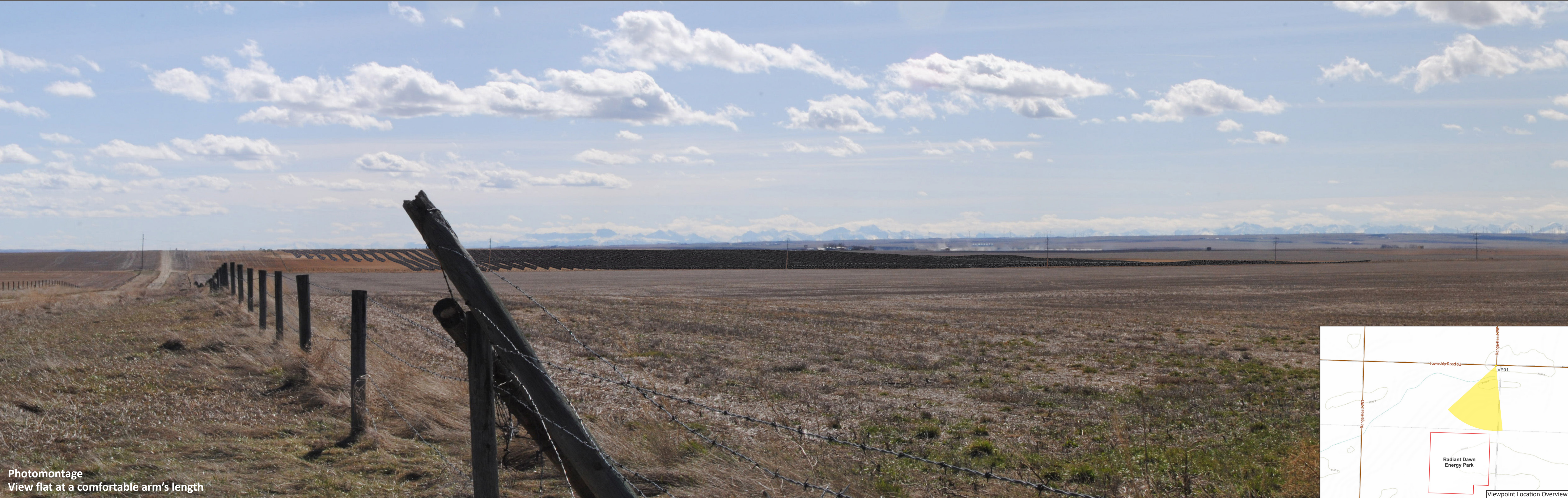
Photomontage View flat at a comfortable arm's length